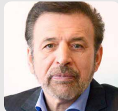
H.E. Dr. Mahmoud Vaezi Minister MINISTRY OF COMMUNICATIONS AND INFORMATION TECHNOLOGY IRAN (pending confirmation)