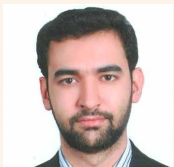
Mohammad Javad Azari Jahromi Deputy Minister, Chairman of the Board & Managing Director TELECOMMUNICATION INFRASTRUCTURE COMPANY