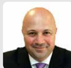
Kaan Terzioğlu CEO TURKCELL GROUP