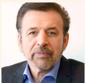
H.E. Dr. Mahmoud Vaezi Minister MINISTRY OF COMMUNICATIONS AND INFORMATION TECHNOLOGY IRAN (pending confirmation)