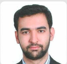
Mohammad Javad Azari Jahromi Deputy Minister, Chairman of the Board & Managing Director TELECOMMUNICATION INFRASTRUCTURE COMPANY